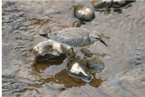
Fig. 7 - Solitary Sandpiper, T. solitaria at the mouth of Ribeira de Machico, Madeira, September 2nd, 2010.