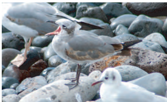
Fig. 10 - Laughing Gull, L. atricilla in Funchal harbour, Madeira, December 29th, 2007.

Two were observed and photographed on the 25th of February 2006 in Funchal harbour, Madeira, by HR, CF and other birdwatchers. A second record was made in the same area by HR and CF on the 29th of December 2007.