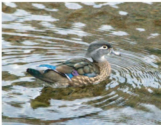
Fig. 2 - Wood Duck, Aix sponsa at the mouth of Ribeira da Janela, Madeira, October 27th, 2009.