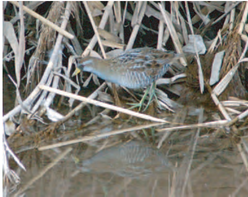
Fig. 5 - Sora, P. carolina at the side of the pond, Lugar de Baixo, Madeira, December 4th, 2006.

One was observed and photographed by CF and HR at the side of the pond, Lugar de Baixo, on the 4th of December 2006. It was regularly seen at the same place until the 10th of March 2007.