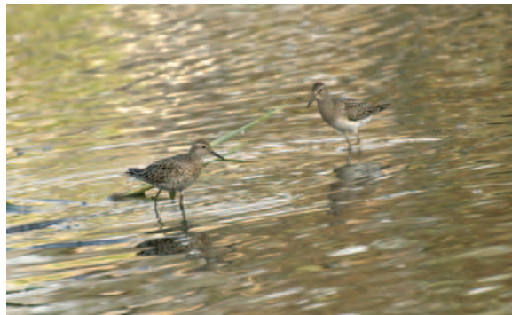
Fig. 8 - Sharp-tailed Sandpiper, C. acuminata (on the left) and Pectoral Sandpiper, C. melanotos (on the right), at the Lugar de Baixo pond, Madeira, August 27th, 2010.