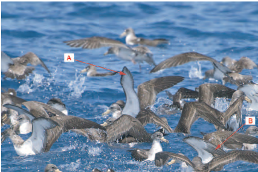
Fig. 3 - Scopoli's Shearwater C. d. diomedea , (A) amongst Cory's Shearwaters off Ponta de São Lourenço, Madeira. It is noticeable the difference in the under-wing colouration, C. d. borealis (B) showing darker primaries than C. d. diomedea .

One was seen and photographed off Ponta de São Lourenço, Madeira on the 30th of August 2010 by CF and HR with four birdwachers. This single specimen was amongst a large concentration of Cory's Shearwaters, in a feeding frenzy. The differences in the under-wing colouration of the two subspecies can be well observed in Fig. 3.