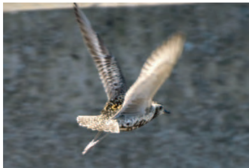
Fig. 6 - Pacific Golden Plover, P. fulva at Caniçal, Madeira, on September 14th, 2010.