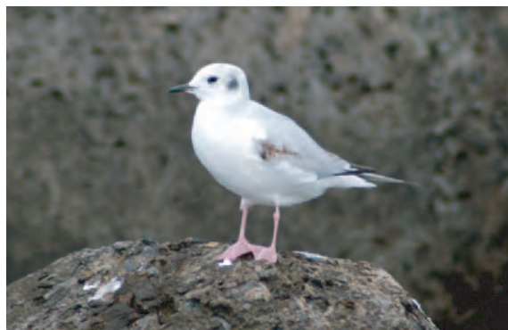
Fig. 9 - Bonaparte's Gull, C. philadelphia in Funchal harbour in February 2007.