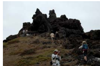
Walk on Selvagem Pequena III