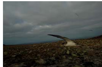
Cory's on Selvagem Grande IV