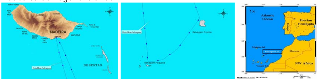
Maps by Jesus Caballero 2005

Fauna and Flora of Selvagens Islands: Due to its isolated geographic localization, the Selvagens Islands are a wonderful spot for marine life, flora and fauna, especially for seabirds, which is known by " Seabirds Sanctuary ". About marine life, Jackes Costeau referred to these Islands as one the best spots for diving on the planet, especially due to non-human impact and crystal waters that allows 30 meters visibility. The scarce benthic life is rewarded by many pelagic fishes.