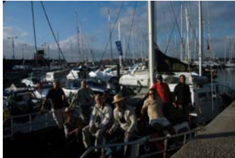
Leaving Funchal Harbour