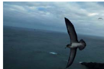
Cory's on Selvagem Grande III