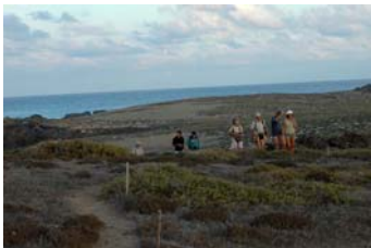
Walk on Selvagem Pequena II