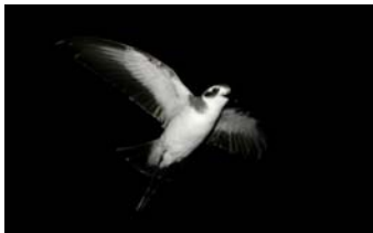
White-faced storm-petrel I