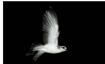
White-faced storm-petrel III