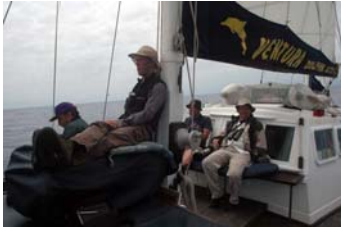
On the way to Selvagens Islands