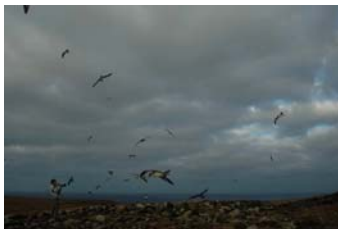
Cory's on Selvagem Grande I