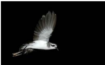
White-faced storm-petrel II