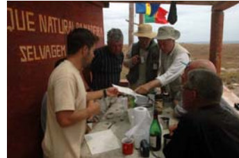
On Selvagem Pequena with the wardens