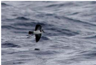
White-faced storm-petrel IV