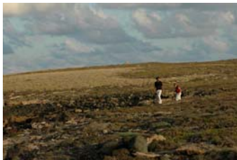
Walk on Selvagem Pequena I